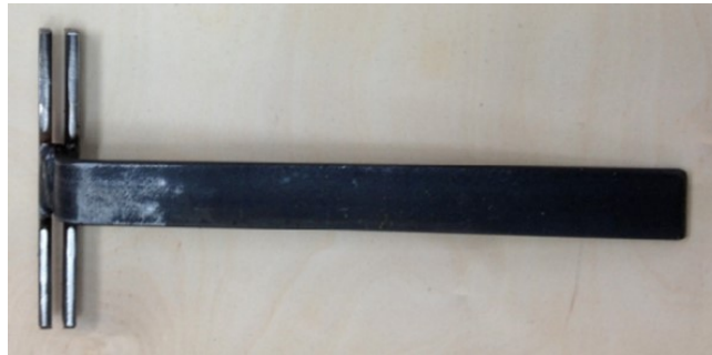
Fig.1 Blade removal tool