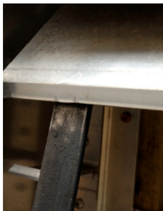
Fig. 2 Tool in situ under a clipped blade